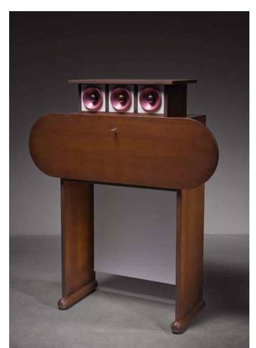
Geology 7, 2000