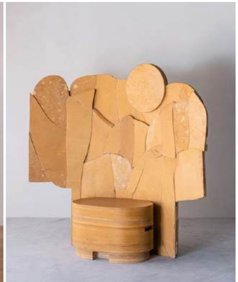
Studio Raw Material