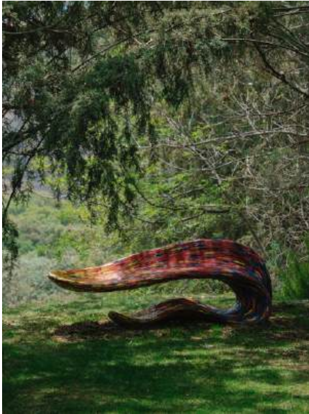
Javier Senosiain, Warm Colors , 2022